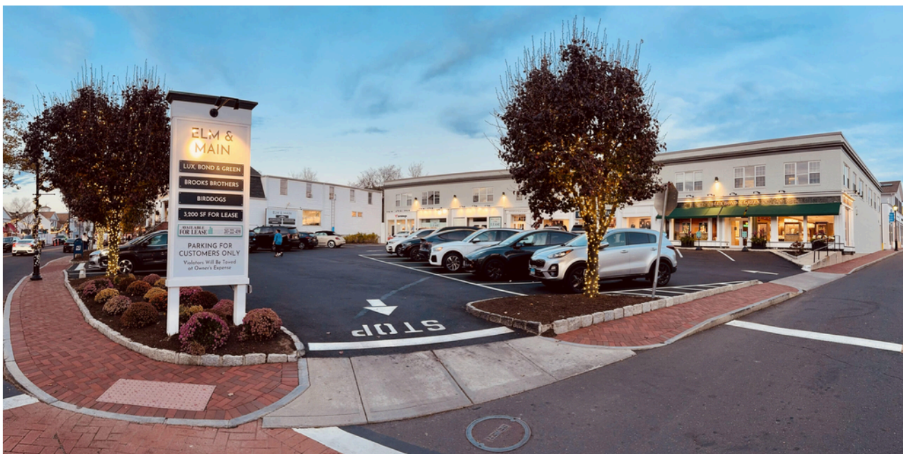
Elm & Main, Westport, CT Mixed Use (Retail/Office), Core/Core+