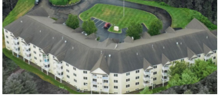
Appleton Oaks, Hampton, NH Multifamily (55+ community), Value-Add