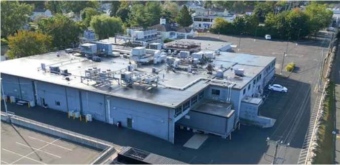
Hamilton Industrial, Stamford, CT Industrial, Opportunistic