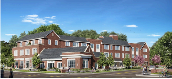
100 East Putnam Ave, Greenwich, CT Mixed-Use (Multifamily/Retail), Opportunistic