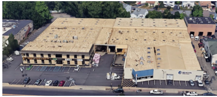
Totowa Light Industrial, Totowa, NJ Flex Space Light Industrial, Value-Add